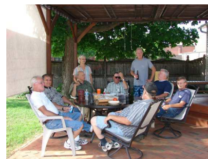
The gang chowing down at the pool party, one of the things they know best.