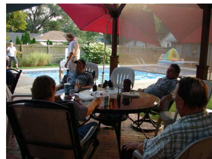
Everyone is placing bets. Is Will K9FO really going to jump in the pool???