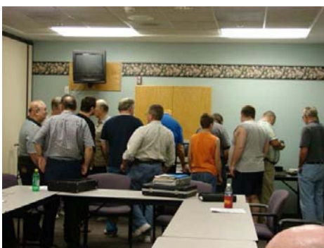
CROWD LOOKS OVER ITEMS BEING SOLD AT OCTOBER KARS AUCTION