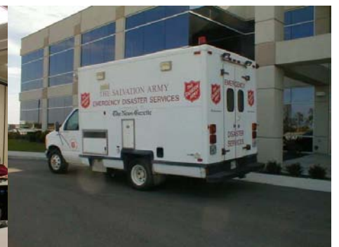
SALVATION ARMY EMERGENCY DISASTER SERVICES VEHICLE AT THE EOC DURING EMERGENCY DRILL