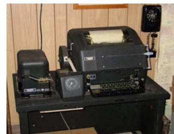
1950 vintage Teletype station, now replaced by a computer

Typical ham RTTY systems send messages at about 60 words per minute, which is about twice as fast as the faster CW operators, and about half again as fast as the popular PSK31 mode. And because it is so easy to put a competition grade RTTY station together, there has been a great increase in its popularity for contesting. In recent years, the number of entries in the many RTTY contests has ballooned.