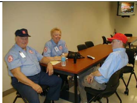
SALVATION ARMY WORKERS BRING FOOD TO THE EOC FOR VOLUNTEERS