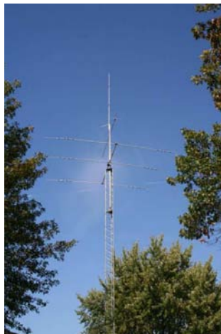
BILL, N9QXZ'S NEW TOWER PROJECT GLISTENS IN THE SUN