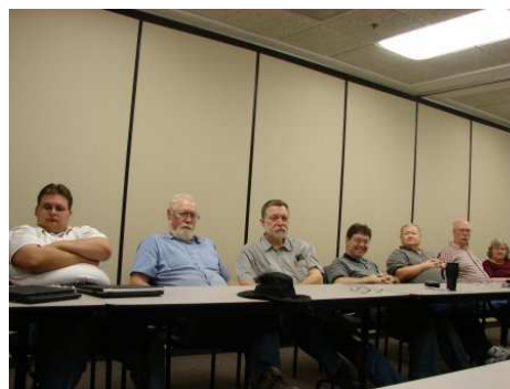
KARS MEMBERS AT OCTOBER MEETING ANXIOUSLY AWAITING THE START OF THE AUCTION