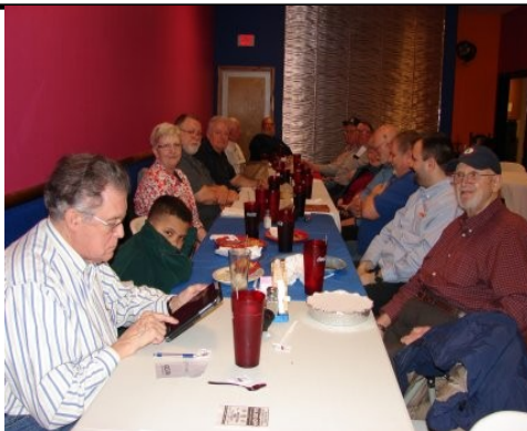
KARS board meeting at El Mexicano Restaurant. The food was outstanding and the meeting room was excellent.

It seems like just yesterday, but it was 10 years ago that KARS celebrated it's 80th anniversary . It has been suggested that the club hold a special event station to commemorate the anniversary year. Everyone's input is welcome. Details will be worked out at future KARS board meetings, as to location and date of the event.