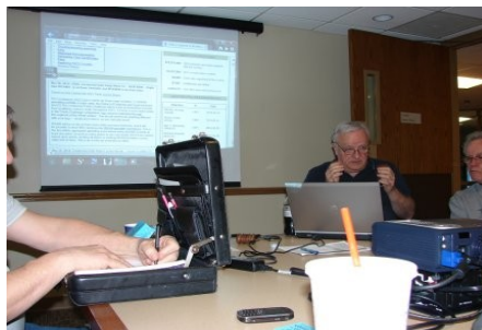
Logbook of the World presentation at April KARS meeting

If we miss your birthday or get it wrong, please let us know!