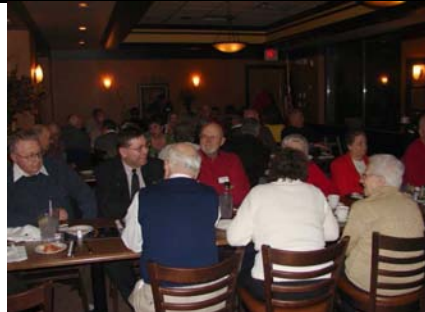
A small view of the large turnout for the annual KARS Banquet More pictures on page 3