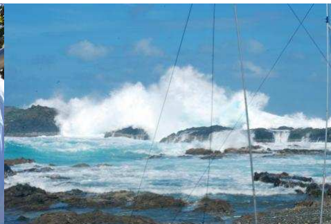
Desecheo DXpedition Soon after arrival the winds churned up the ocean resulting in huge waves that took down some of the antennas