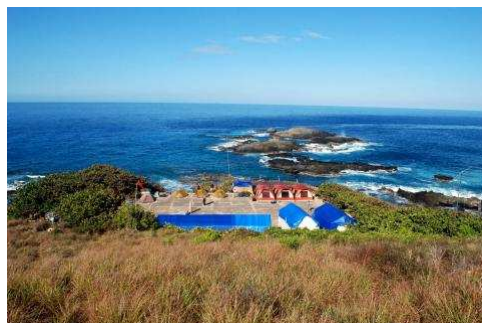
The heliport pad was also the operating/staging/eating/sleeping area

Remember to pass the word about the fabulous KARSFEST in July!