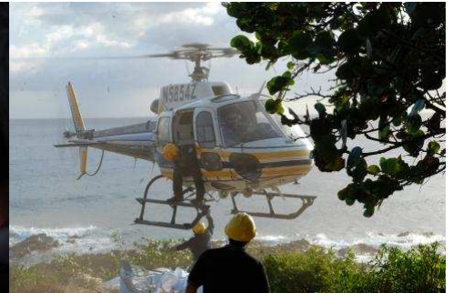
Desecheo DXpedition Yet another helicopter load of supplies arrives