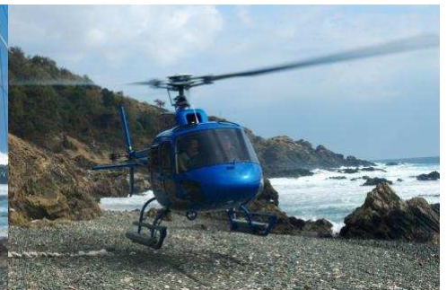
Desecheo DXpedition The surf was so rough that crew change had to be done with helicopters instead of the Zodiak (boat)