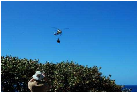
Desecheo DXpedition One of countless helicopter flights ferrying in heavy equipment...over seven tons...not counting operators!