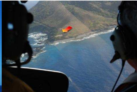
Desecheo DXpedition Helicopter pilots perspective of the landing pad on Desecheo