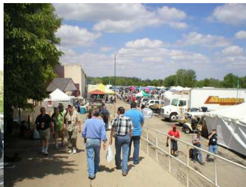
Just a tiny corner of the vast flea market at the Dayton Hamvention

*K9NR claims a medical procedure slowed him down some.