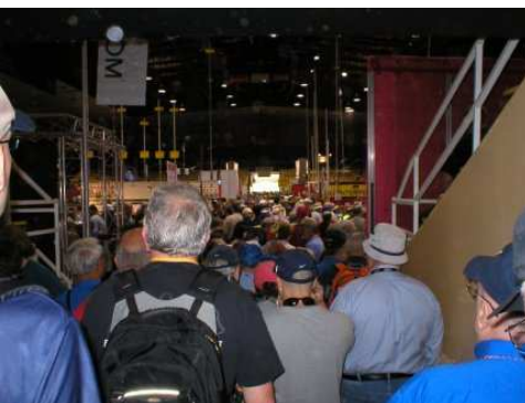
The stadium crowd at the Hara Arena At Hamvention 2011

WR9L, K9FO, N9REG, NI9H, WA9FTU, K9NR, N9IO, W9DX