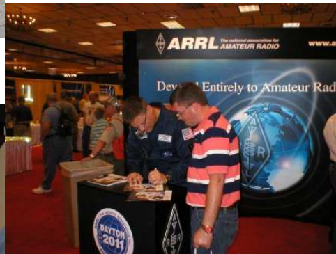
Astronaut Doug Wheelock, KF5BOC signs autographs at the ARRL Expo