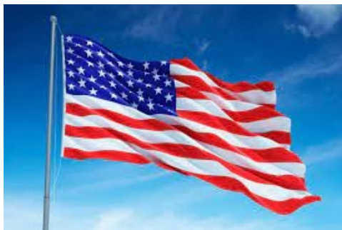
The United States of America

July 2 N9FD July 2 KC9QJV July 10 K9SAT July 11 W9CD July 13 K9UNO July 14 K9KSG July 16 KC9VWP July 25 N9REG July 25 KB9VR July 27 KD9SKR