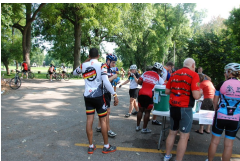
Cyclists stop at Momence Island

Don't forget the Two Rivers Bicycle Tour!!!