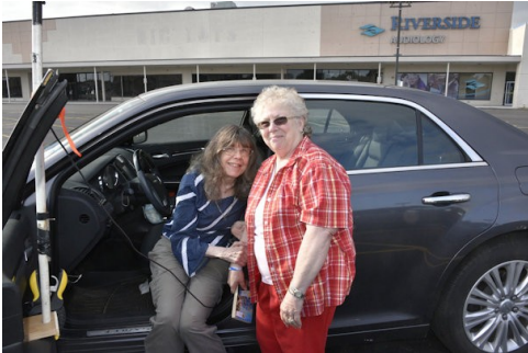
K9QT & KD9CFV at the start