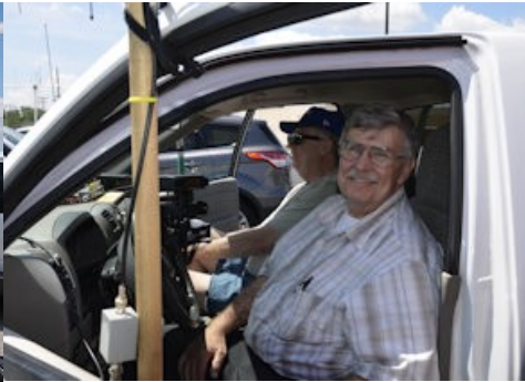
N9DWE & KA9TAG - Tag team?