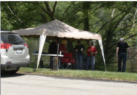
Sneaky Fox pavilion