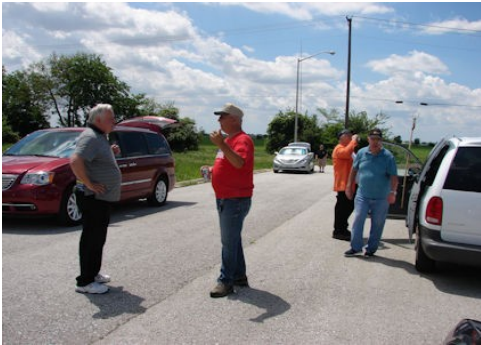
Comparing notes at the finish