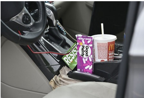
Secret hunting supplies