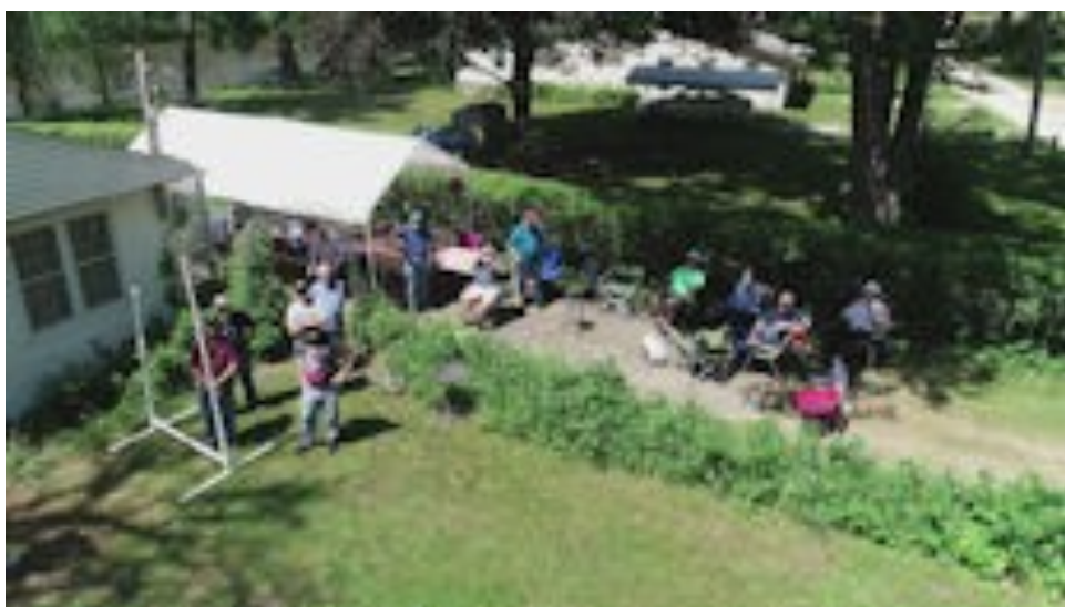
An aerial view of the Chicago Radio Mobileers 160 picnic at K9FO's Momence river cottage. Beautiful day for outdoor radio fun!

The KARS board meeting will be held on Tuesday, July 17th at El Mexicano. Eat at 6PM. Meet at 7PM. All members are welcome.