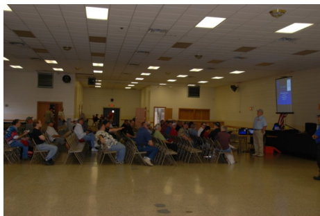
Well attended forum at a past KARSFEST

July 2 K9KSG July 9 K9NR July 16 N9OE July 23 N9LYE July 30 N9FD Don't forget the net!