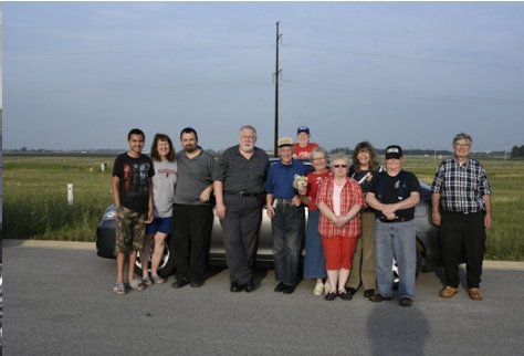
Hunters at the finish line