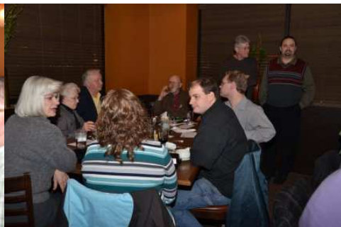
Did you see the door prizes?