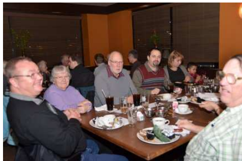
Where's the food?