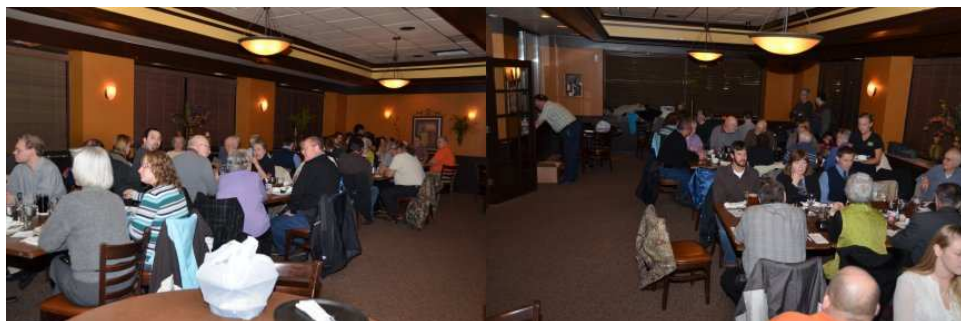
A view to the right