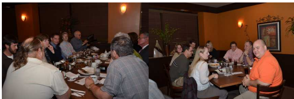
Wish he'd pass that menu down this way I told you that shirt would clash with the wallpaper!