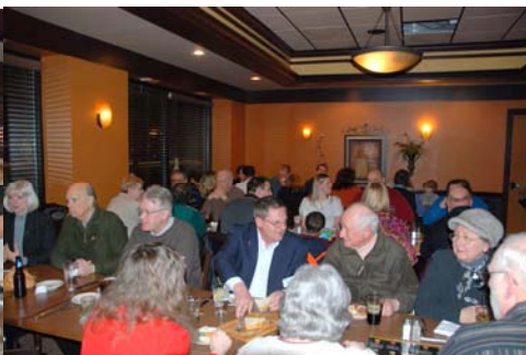
The KARS crowd at the Brickstone looking right...