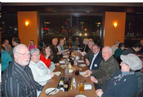
Down the middle!