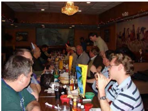
News Year Eve at El Campesino's and the living is fine for this group of KARS members