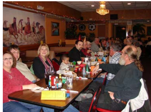
More of the gang hungrily waiting for their food. "Muy Bueno!"