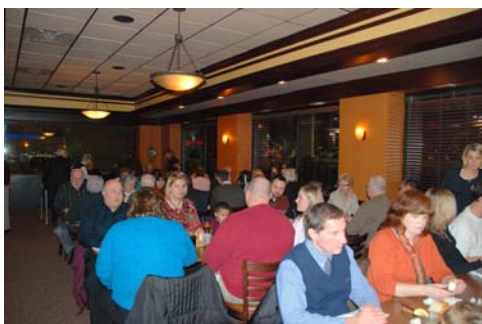
The KARS crowd at The Brickstone looking left...