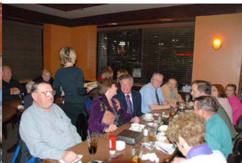
KARS folks sure know how to have a good time!