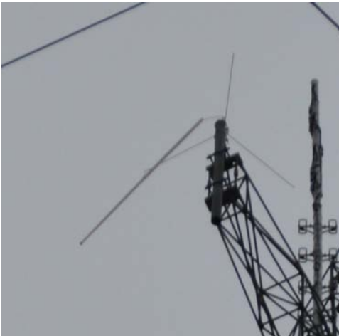
Tornado damaged remote repeater receiver antenna on the Diamond tower Story on page 3

***Change of Venue: It has been decided to hold a January 7th general meeting and cancel the Jan board meeting.