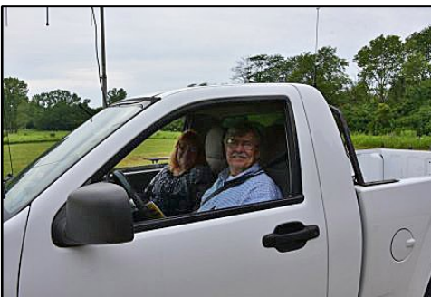
July 26 — Foxes N9DWE & MJ

We will attempt to cluster the mobiles together. Be mindful of where to park if you don't have a mobile to display. See you there!