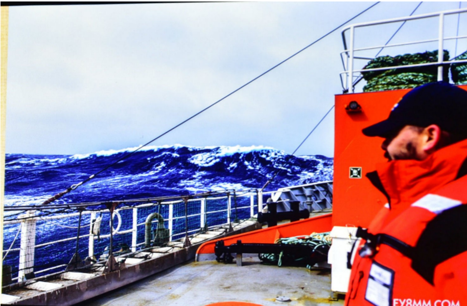
A view of the southern ocean en route to Bouvet Island! Boat ride anyone?