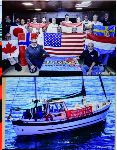
Welcome to Cape Town to the intrepid Bouvet operators!

Once a month for the past several years, a group of Midwest Contester/DXers have met in various Bloomington Illinois restaurants to visit, exchange information, ideas and enjoy fellowship. Several KARS members usually attend. This month WB9Z, N9TK and K9CT, "fresh" from their attempt to tackle Bouvet Island for DXers everywhere presented a fascinating insider program on their incredible journey. Here are some of the pictures from the trip and that evening.