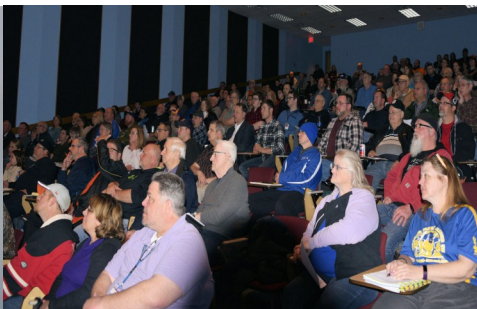
A packed auditorium listens intently to the severe weather spotter presentation. KARS was well represented as many members attended.