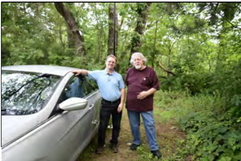
N9FD & N9IO at the August 10th Fox's lair. Last known picture of N9FD before being totally consumed by a massive cloud of twin engine mosquitoes. Still, it was a great hunt!

September 11 KD9CGA September 15 K9BIG September 15 KD9CFV September 15 W9WWE September 15 W4HYB September 18 KC9CAZ September 21 WB9RUE September 29 Terry September 30 WB9Z