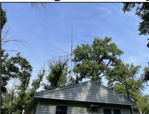
One last view of Will K9FO's Hex beam on his river cottage

September 11 KD9CGA September 15 K9BIG September 15 KD9CFV September 15 W9WWE September 15 W4HYB September 18 KC9CAZ September 21 WB9RUE September 29 Terry September 30 WB9Z