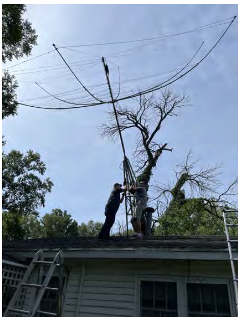
Aerial crew starting to remove the K9FO Hex Beam.