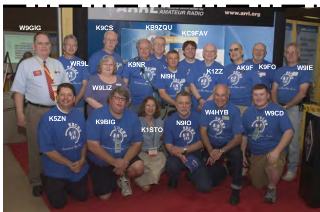
KARS members at ARRL EXPO/Hamvention2006 KARS Int Space Station contact recognized by ARRL