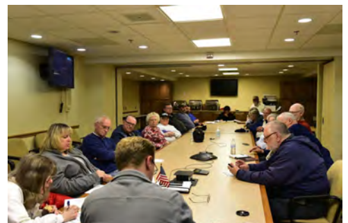
KARS November general meeting