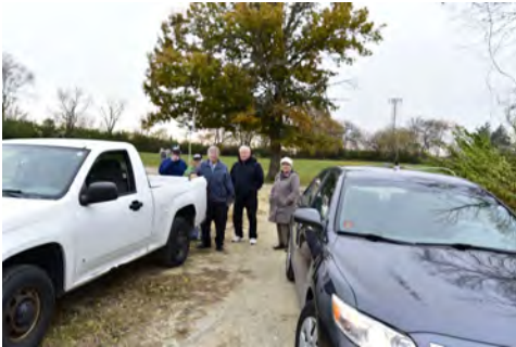
Hunters gather at the foxes lair