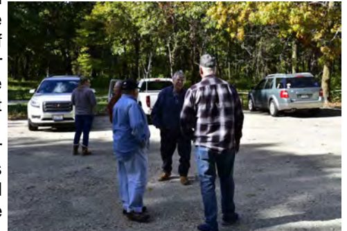
Hunters gather at the October 19th hunt