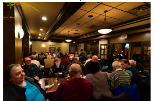
2018/2019 KARS Banquet pic [archive]

SAMPLE ballot—Actual ballots to be distributed at December general meeting