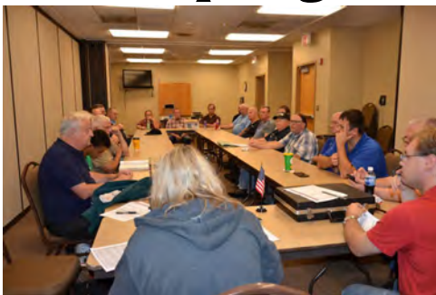
Eagerly Awaiting Start of Auction at October meeting

After a brief business meeting, there will be a program on Contesting with video graphics. See you there!