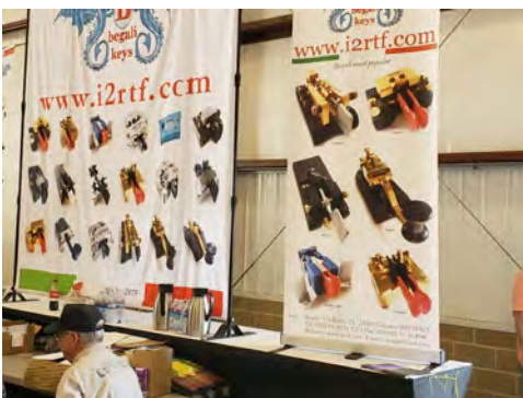
Italian Keys and paddles from Begali