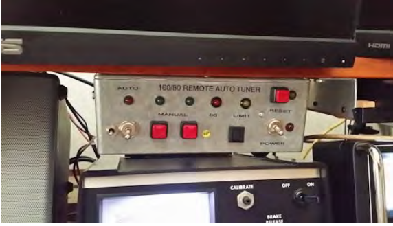
Control head mounted in the shack