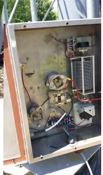
Motorized and remotely switched components inside the tuner housing