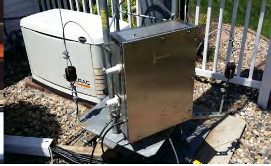
External view of the remote tuner housing