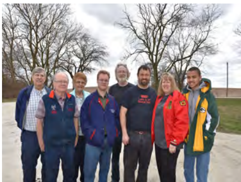
Group shot at the finish