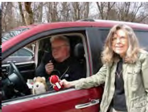
Fox K9NR is found by winner K9QT