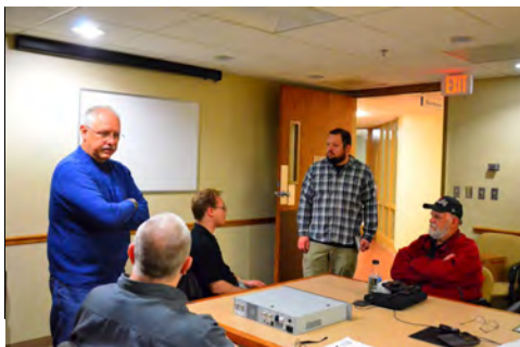
KARS members inspect one of the new repeaters at the April meeting