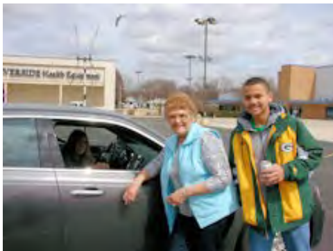
KD9HSD and N9BMB at the start