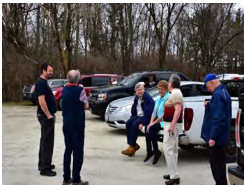
Hunters gather at the Fox's lair