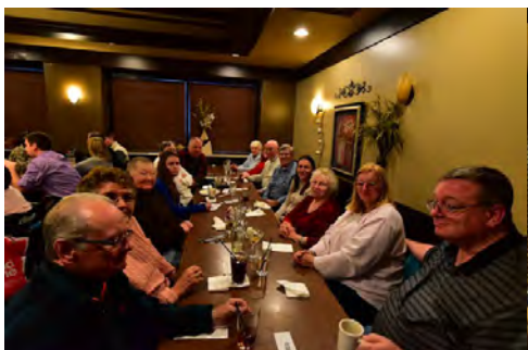
Some big smiles there!

A great evening, wonderful people & prizes