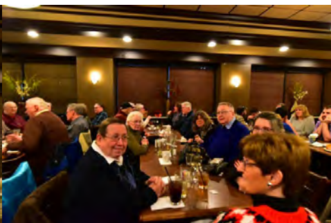
WA9WAQ enjoying the evening