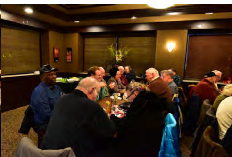
The table closest to the prizes!