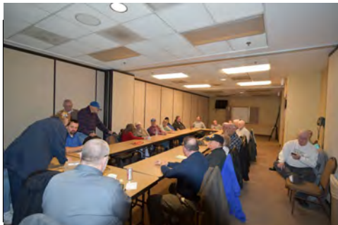
Taking care of business at the December KARS meeting

Active military dues are waived Make out your checks to: "KARS"