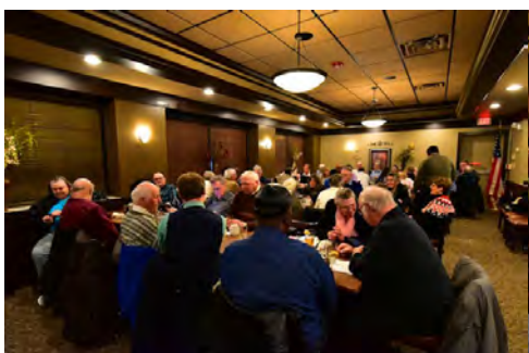
A house limit crowd!