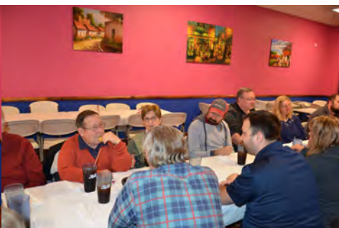
That's a lot of smiling faces