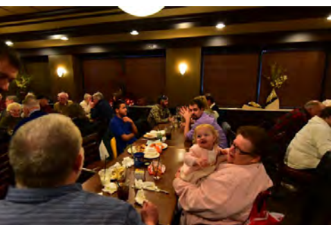
Little ones had fun! What's her code speed?