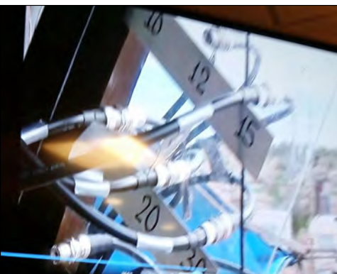
A view of the antenna patch panel use at FT5ZM - K1N and other DXpeditions, constructed by Clay N9IO. It has traveled to remote regions of the globe.

Nov program photos with Jerry WB9Z - Amsterdam Is FT5ZM