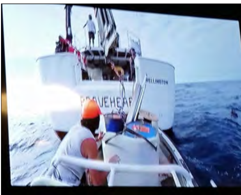
Offloading barrels of equipment and supplies from the Braveheart for the FT5ZM Amsterdam Island DXpedition in the faraway Indian Ocean

More nominations for all positions are allowed right to the election.