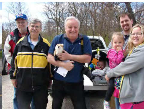
The fox K9NR with tied teams N9DWE/ KD9JMS & W9IOU/K9UNO family