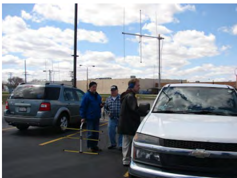
K9KSG explains to W9IEY that he is pointing his antenna the wrong way