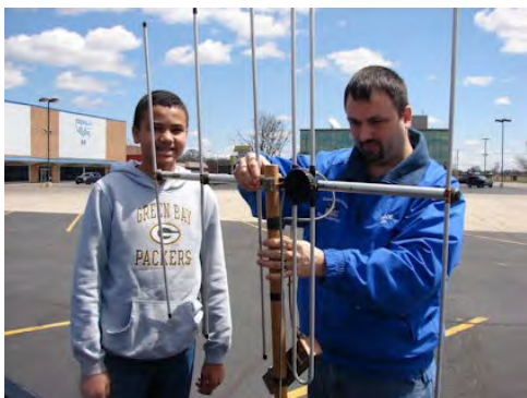
N9BMB & N9OE That doesn't look quite right Dad!