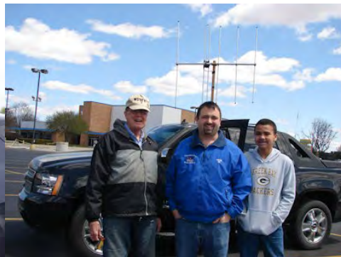
WD9FYF - N9OE - N9BMB