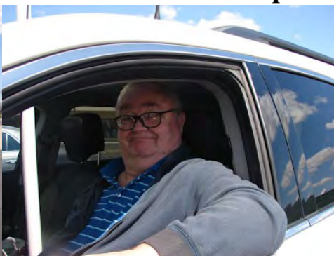
WU9D Sporting a transmitter hunt smile