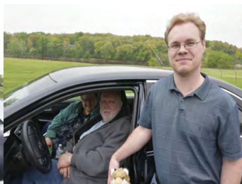
Winner N9FD with foxes N9IO & N9IOQ