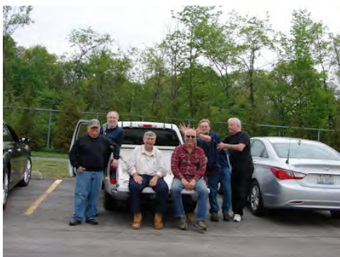
A gathering of eagles? Turkeys?