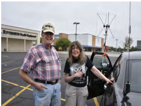
WD9FYF - K9QT