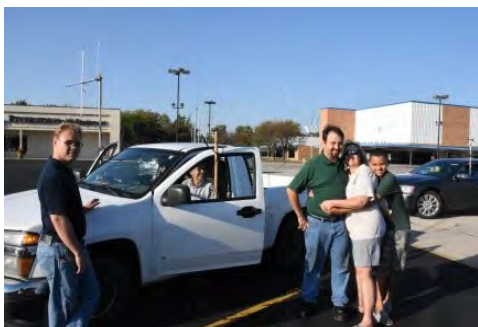
Hunters gather at the start