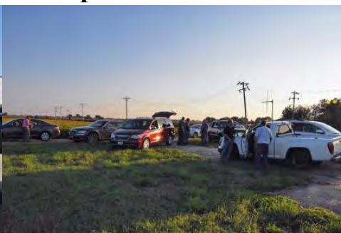
Eight hunting teams arrive at the fox's lair