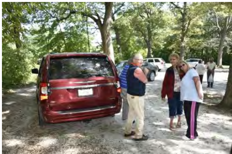
Comparing notes at the Fox's lair