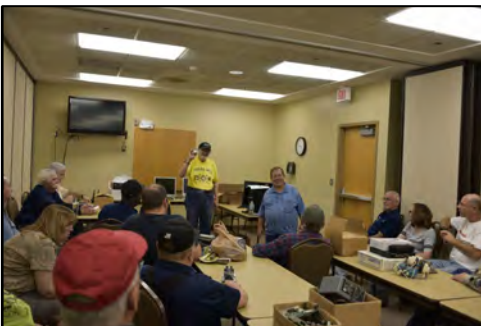
Action at the 2016 KARS Auction Don't miss out this year!

October 2 N9RJM October 9 KD9CGC October 16 N9OE October 23 K9NR October 30 K9KSG