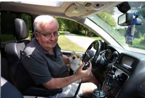
The Fox: K9NR