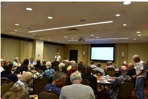
A view of the crowd listening to SMC President Craig K9CT's opening remarks

The Society of Midwest Contesters Conference