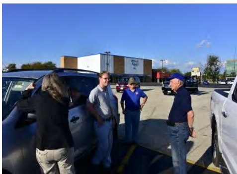
Comparing notes at the start