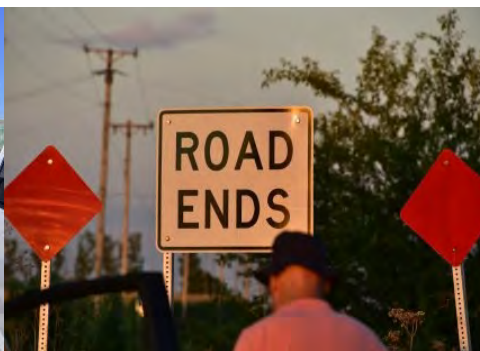
UH OH! The sign says it all!