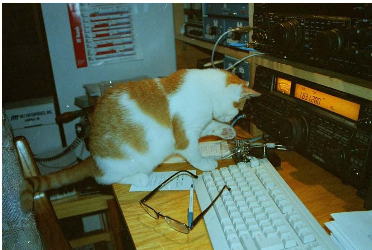
Pounding the Brass - Louie the Cat - Was The Purrrrrfect CW Operator