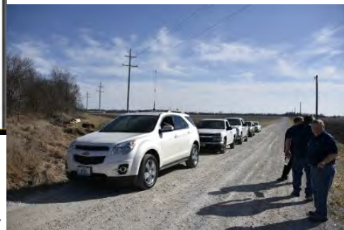
Hunters starting to arrive and lining up at the Fox's lair