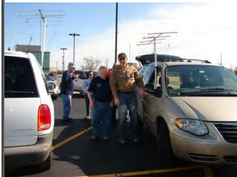
Rigging up at the start