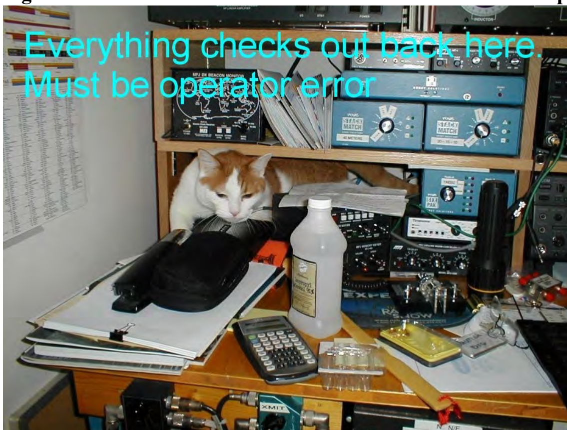
When troubleshooting in awkward places, four paws were better than two! Rest in Peace Louie