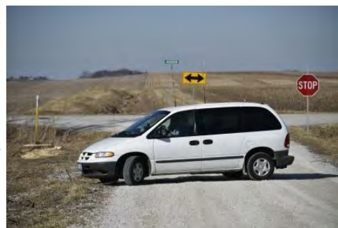
KB9VR & KA9MDJ arriving at the hidden transmitter.