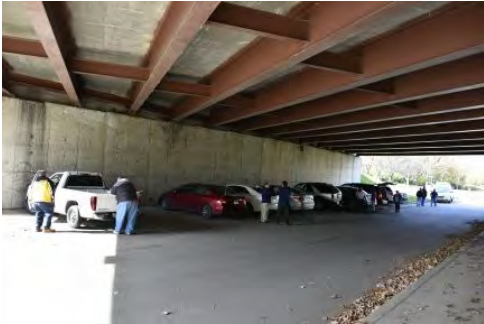
November 5th Hunt Hunters arriving at fox's lair