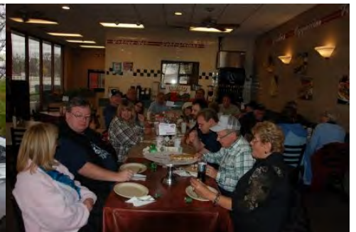
November 19th Hunt After Hunt Dinner at Mancinos