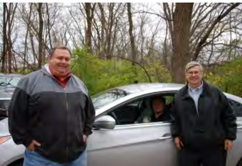
November 19th Hunt Fox N9FD & Winners N9DWE & KC9YDA