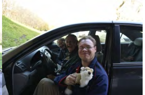
November 5th Hunt Fox W9IEY & Winner N9FD