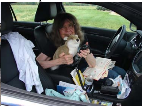
The Fox K9QT