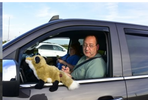
The Fox KD9FVM