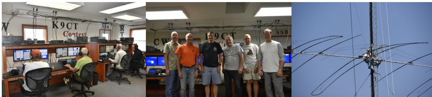
The operating positions at K9CT