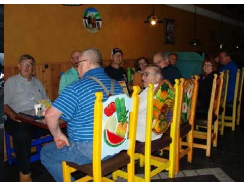
Food afterwards at El Mexicano's Yum!