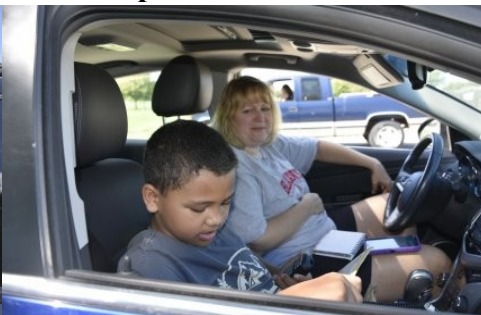
The Foxes N9BMB & N9DLD