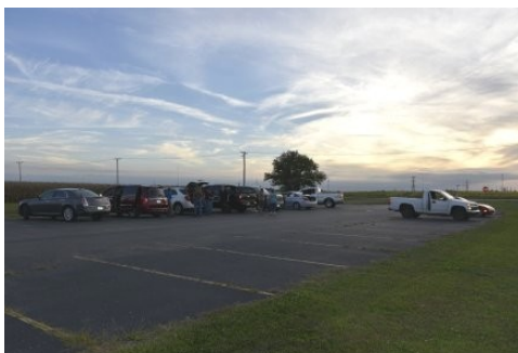
Hunters gather at the foxes lair in rural Bourbonnais