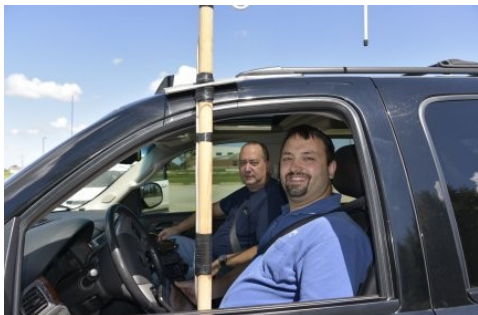
Winning Team N9OE & KD9FVM