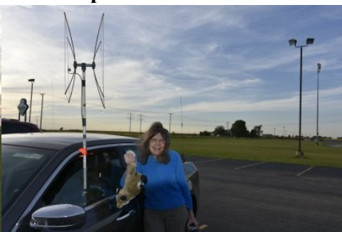
The Winner K9QT