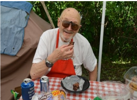
Will K9FO at the Chiburban Radio 160 Mobileers Spring Picnic