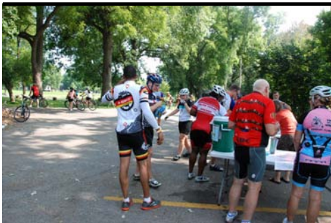
Wheelmen (and women) at the Momence River Island food & water stop during the 2014 Two Rivers Century Bicycling Tour