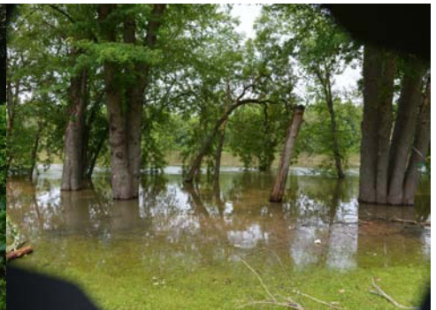
Group meets Tuesday mornings on 160 meters. Yep...it had RAINED!