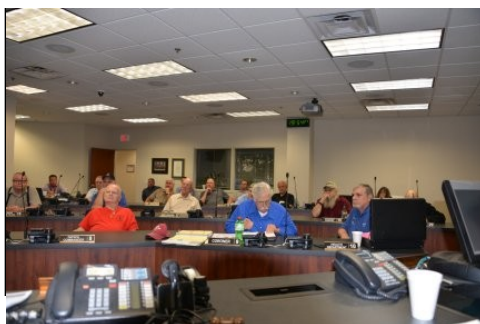
June meeting at the ESDA Center

Following a brief business meeting and final KARSFEST plans, there will be a program on how repeaters function and a roundtable discussion of emergency communications net procedures. This is a great opportunity to brush up these important skills. CU there!