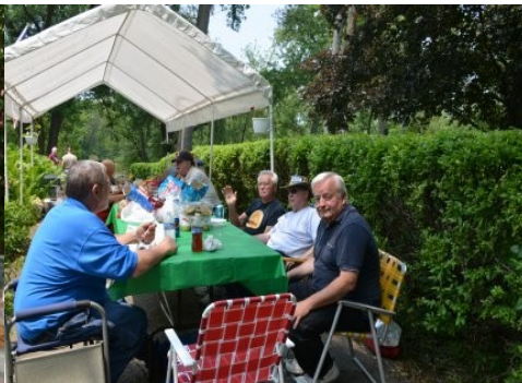
Another view of the picnic at K9FO's Momence river cottage