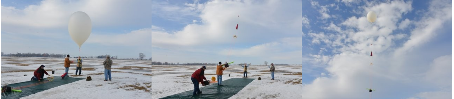
A series of photos (above and below) of the launch from Koerner's Airport