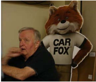
KARS car fox chastises Don K9NR for yawning.

A good program really makes for a good meeting! So what's your idea for a good program?