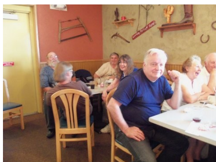
Hunters fill up two tables at Coyote Canyon after the hunt, eager to compare notes and claim bragging rights