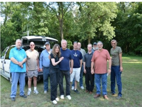
Foxhunters pose for picture and make plans of where to eat after the hunt