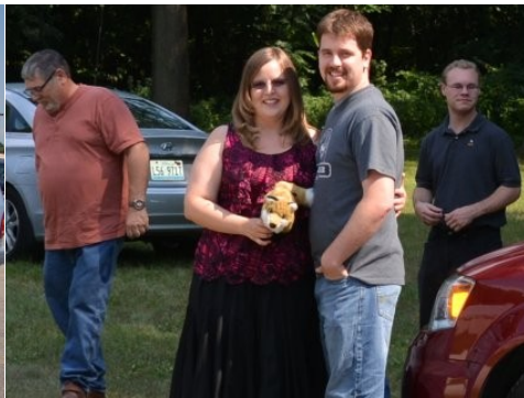
Crafty FOXES Crystal W9IOU and Rodney K9UNO at the Foxes lair

N9IO: Grumble Grumble, K9NR: Grumble Grumble, N9LYE: Grumble Grumble