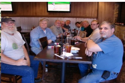
The "Post-Hunt" Feast... Something everyone wins!