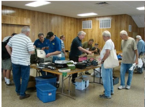
KARS club table. People line up to put ticket stubs in drum.