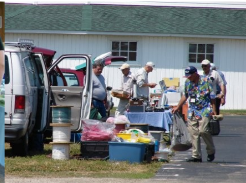
Walking through the flea market, hams find many bargains.