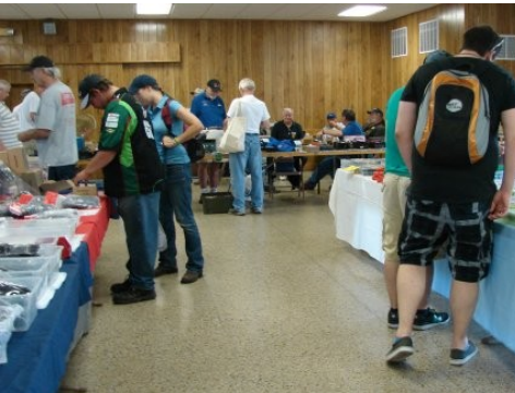
Inside vendors provide lots of goodies for air conditioned shopping