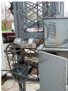
Close-up view of the power winch and control box -N9RJM