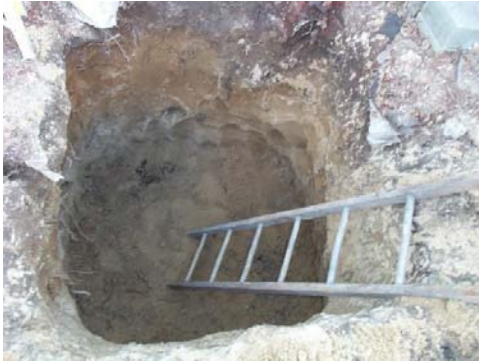
A large free standing tilt over tower requires a LOT of concrete in a BIG hole! -N9RJM

It's Spring! ...and a young man's fancy turns to... Towers and Antennas...of course!