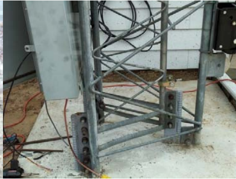
The concrete and tower base in position -N9RJM