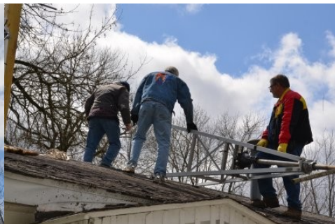
Rollie N9RJM lends a hand lowering K9FO's satellite antennas in preparation for a new roof