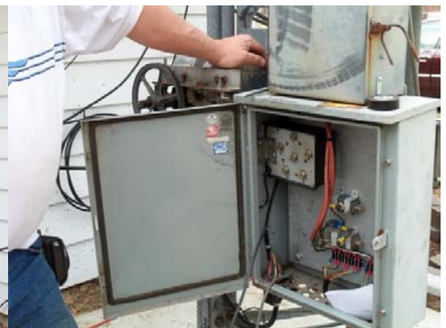
An inside view of the control box showing the tower wiring and a remote coax switch -N9RJM