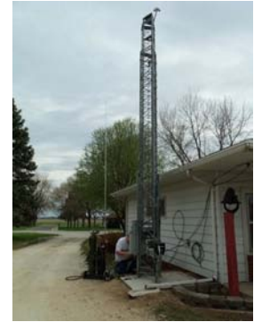
The fully nested tower in place -N9RJM