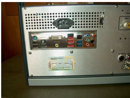
AC for power supply

I have posted some Pictures of the project on my qrz.com page under my call W9YNI