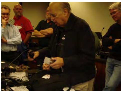
Howard AK9F demonstrating the LP-100 digital vector RF watt meter