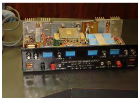
El Presidente Bill N9OE showed a dual voltage power supply he built sometime back in the 90's