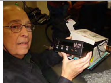
At right AK9F shows an LP-100 digital vector watt meter (story continued on page 2)