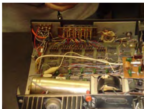
Inside look at Ken's freq counter