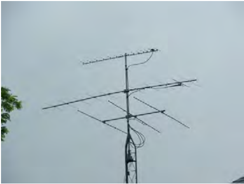
Skyhooks for 6 & 2 meters & 70 centimeters