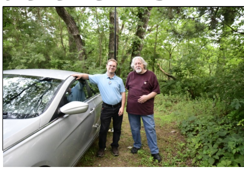
N9FD & N9IO at the August 10th Fox's lair. Last known picture of N9FD before being totally consumed by a massive cloud of twin engine mosquitoes. Still, it was a great hunt!

September 11 KD9CGA September 15 K9BIG September 15 KD9CFV September 15 W9WWE September 15 W4HYB September 18 KC9CAZ September 21 WB9RUE September 29 Terry September 30 WB9Z