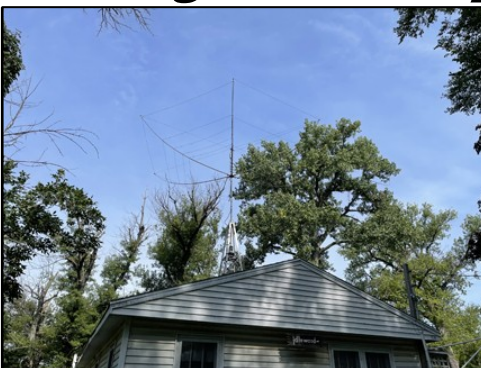
One last view of Will K9FO's Hex beam on his river cottage

September 11 KD9CGA September 15 K9BIG September 15 KD9CFV September 15 W9WWE September 15 W4HYB September 18 KC9CAZ September 21 WB9RUE September 29 Terry September 30 WB9Z