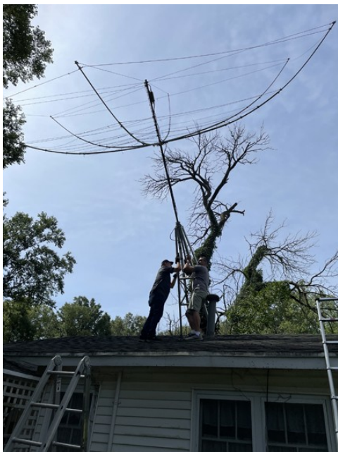
Aerial crew starting to remove the K9FO Hex Beam.