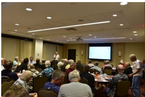
A view of the crowd listening to SMC President Craig K9CT's opening remarks

The Society of Midwest Contesters Conference