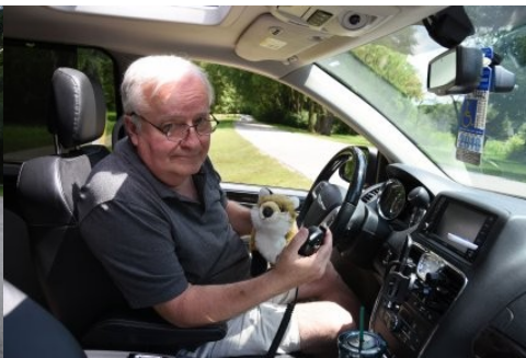
The Fox: K9NR