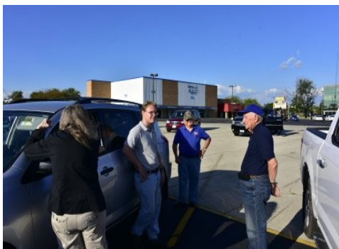
Comparing notes at the start