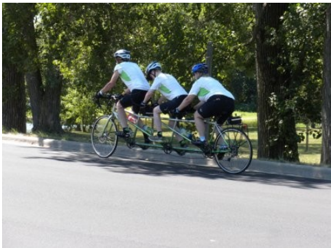
A bicycle built for three!