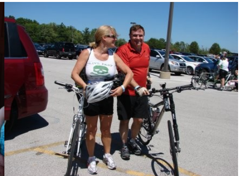
Cyclists near a "Sag Wagon" at Splash Valley