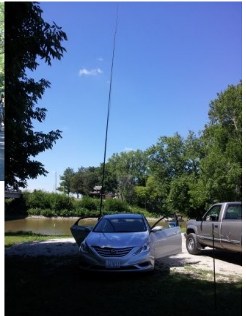
Craig N9FD's mobile rest stop near Plato Bridge in Iroquois County