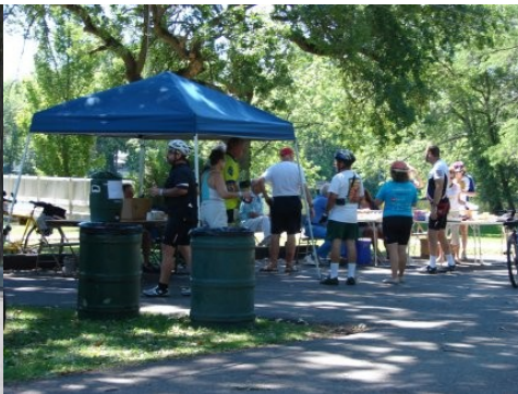
The Rest Stop at Island Park in Momence