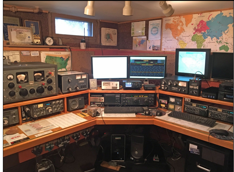
KARS SHACK OF THE MONTH—WR9L Send in your shack photo today!