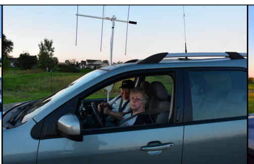
K9KSG & KD9CFV closing in on the foxes