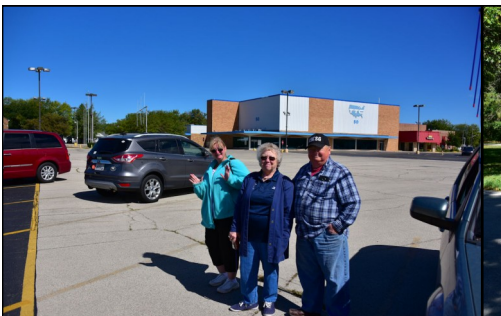
The hunters gather at the Meadowview starting point