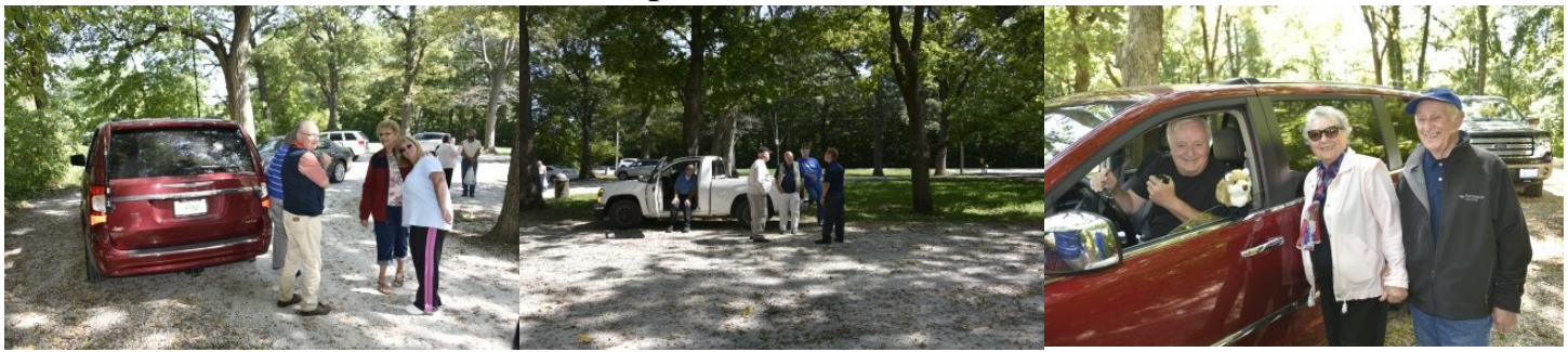
Comparing notes at the Fox's lair