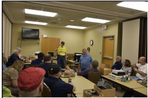
Action at the 2016 KARS Auction Don't miss out this year!