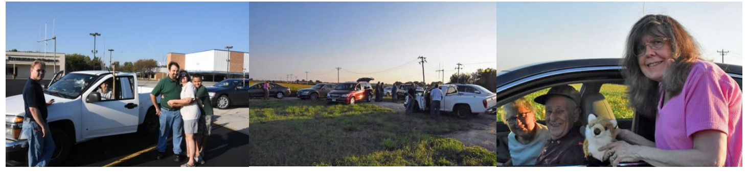
Hunters gather at the start