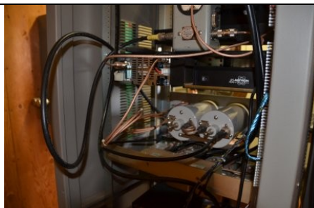
Inside the 440 Repeater. One of the 3 that received a new controller.

Let us know if we miss your birthday or get it wrong.