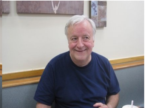
Don K9NR ready for lunch after the hunt