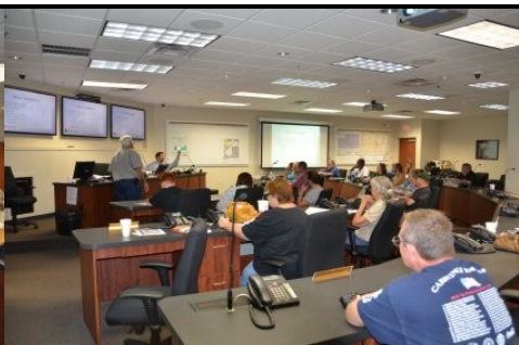
Two views of the Technician Class course taught by KARS members at the Kankakee County Incident Command Center