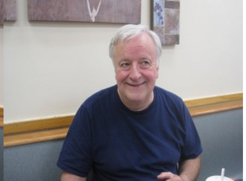
Don K9NR ready for lunch after the hunt