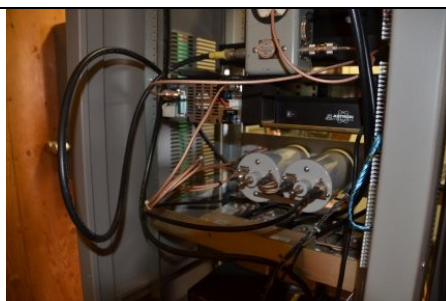
Rear view of the new 444.800 repeater during installation

October 6 N9LYE October 13 N9RJM October 20 N9OE October 27 N9FD