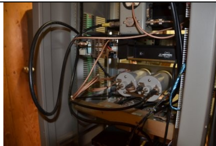
Rear view of the new 444.800 repeater during installation

October 6 N9LYE October 13 N9RJM October 20 N9OE October 27 N9FD