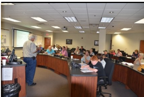
Two views of the Technician Class course taught by KARS members at the Kankakee County Incident Command Center