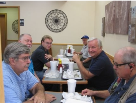
The post hunt gathering at Poor Boy's 2 restaurant