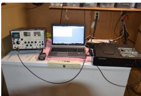
Final programming & tuning of the 444.800 repeater at K9NR QTH