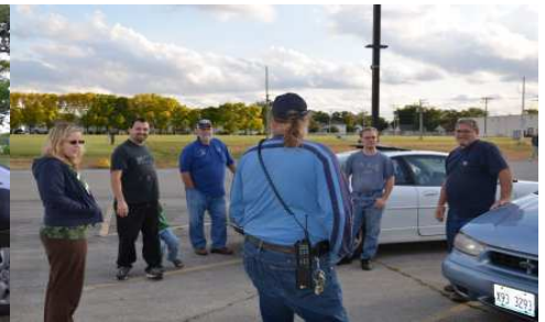
The gang gather at Meadowview before the big hunt.