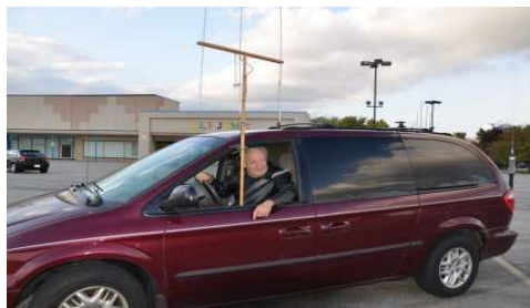
Don K9NR found fox first, but was 2nd due to mileage