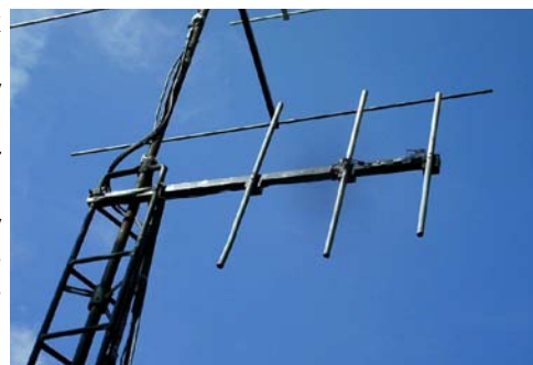
The finished antenna in position on the tower