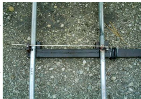
Close-up view of the stub-style feed system