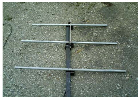
Another AK9F design/N9LYE construct collaboration