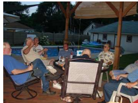
It was starting to get dark before the KARS group settled down enough to hold a very "brief" business meeting.