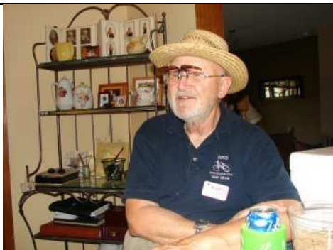
Will K9FO takes an indoor break to sneak some snacks from the buffet table.