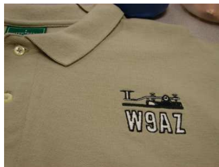
W9AZ logo on new tan KARS shirt

Let the newsletter editors know if we miss your birthday or get it wrong.