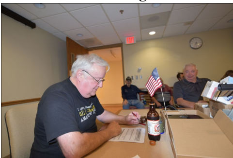
Photo collage of the annual October KARS auction